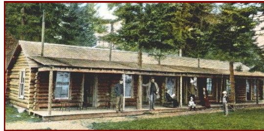
Traditional Sporting Camp as shown in this 1906 postcard