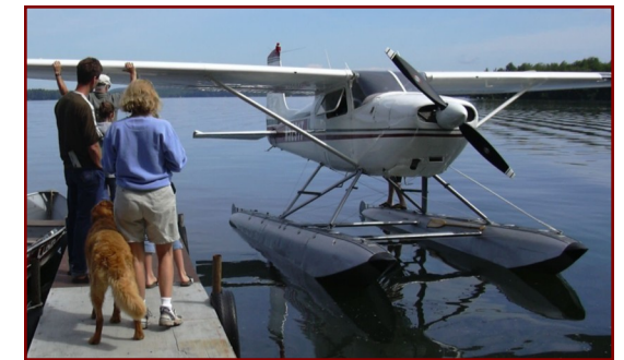
Seaplanes were often necessary to reach remote sporting camps

The Foundation engages in economic development activity by preventing further economic deterioration and higher unemployment in the rural communities whose economies depend to a large extent on visitors to these traditional Maine sporting camps.