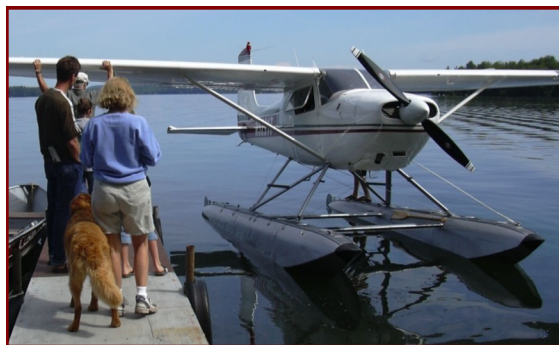
Seaplanes are often necessary to reach Maine's most remote sporting camps

For example, sporting camps are typically located on waterfront property that can be sold at prices far higher than what commercial sporting camp operations can support. As a result, many sporting camps have already been purchased by individuals who later converted the camps into private vacation properties with no access available to the general public.